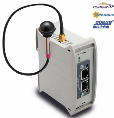
UC-RF control unit

Small production batches and different formats are setting a new trend among packaging, food, and pharmaceutical sectors. Plant and equipment require components able to offer high flexibility production issues.