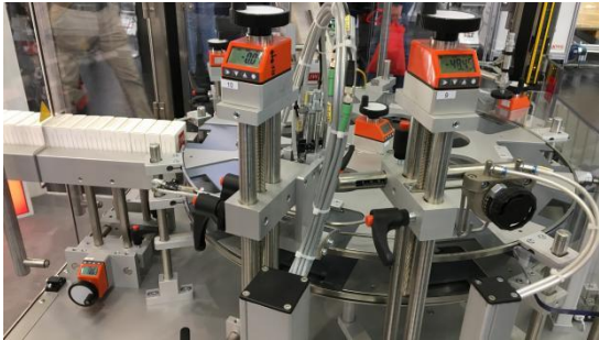
Elesa DD52R-E-RF electronic position indicators application on a JW Verpackungstechnik packaging machine

Moreover, the wireless system doesn't need the supply cable installation and the data swap between indicators and the control unit. Therefore, time and errors sometimes generated by a difficult and expensive installation are reduced to the minimum.