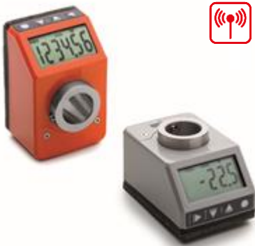
DD52R-E-RF electronic position indicators