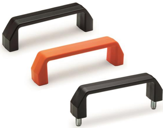
M.543 bridge handles, black or orange colour, with brass boss and threaded blind hole or zinc-plated steel threaded stud.

M.543 bridge handles offer resistance to tensile stress and impact stress. Breaking tests have been carried out by means of appropriate dynamometric equipment under the illustrated test conditions and at room temperature.